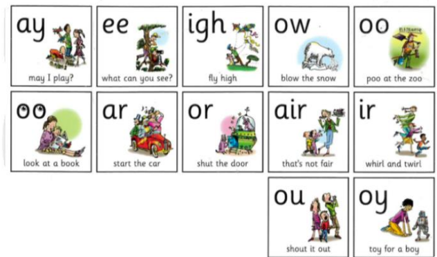
Speed Sounds Set 2

can decode effectively in a fun and engaging manner. This practise also helps to prepare the children for the Phonics Screening Check in Year 1.